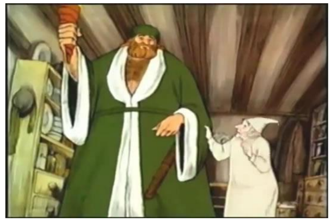
Scrooge asked "Will Tiny Tim live a long life"? The Ghost of Christmas present replied "Probably not". This touched Scrooges heart and saddened him.